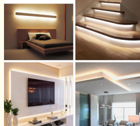
Indoor Use Scenarios