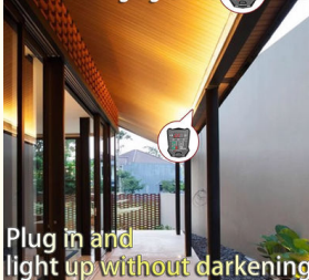
Full Line Of Highlights Without Flicker

High Flexibility Adapt To Various Styles