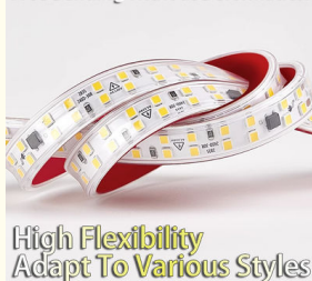
Free Bending Without Deformation

High Flexibility Adapt To Various Styles