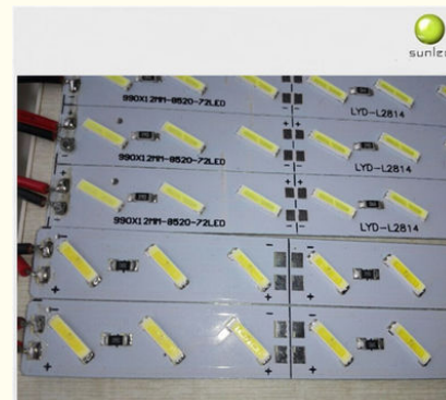
8520led rigid strip72leds/pcs