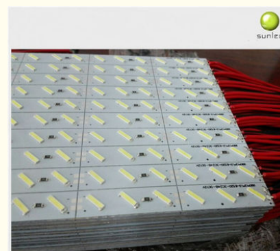
8520led rigid strip72leds/pcs